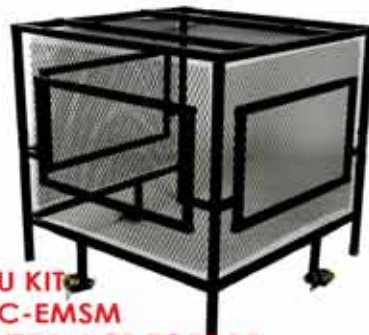
ACGU KIT W/ AC-EMSM W/ 1XTRA ACB TOPBAR