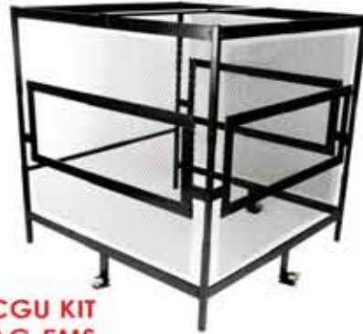
MACGU KIT W/ AC-EMS