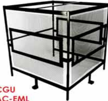
MACGU W/ AC-EML